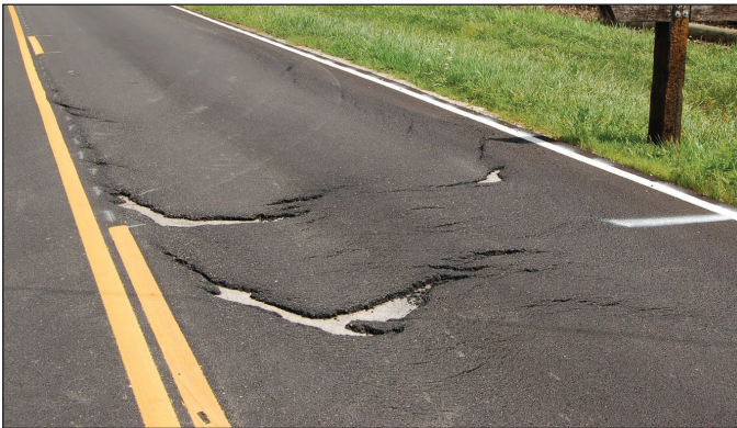
Figure 1 Example of a slippage failure due to poor bond strength.

In order to improve bond between HMA layers, tack coats are used. However, existing guidelines for the selection of tack coat materials and application rates are not clear. To improve tack coat guidelines, a test method and criteria were needed for measuring bond strengths between HMA layers.