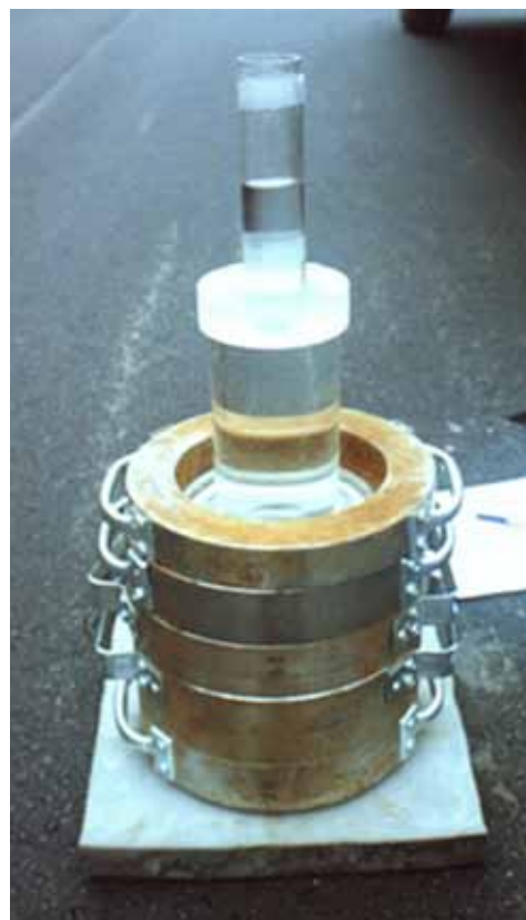
Figure 1. Field Permeameter used in study