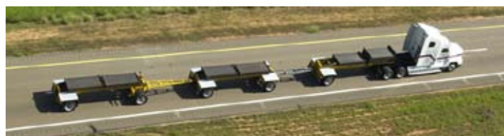
Figure 2. Accelerated loading of test sections is accomplished with four heavy loaded triple-trailers.

All dense-graded mixes were designed with the Superpave mix design method. The nominal maximum aggregate size of the wearing course mix ranged from 9.5 mm to 12.5 mm.