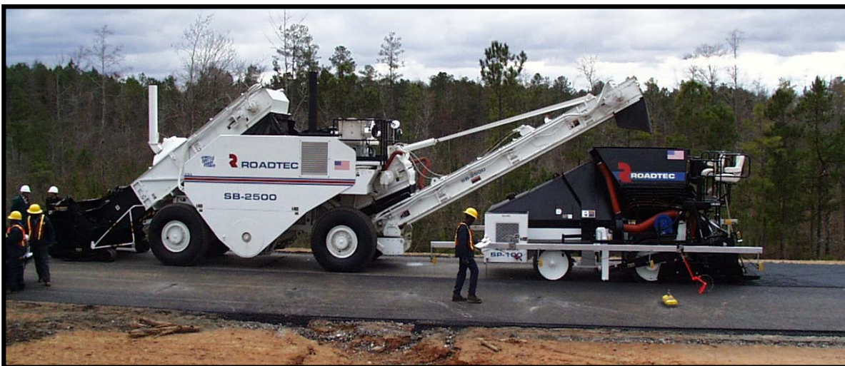
Figure 5. Paving Equipment Typically Used to Place Mixes in Outside Lane