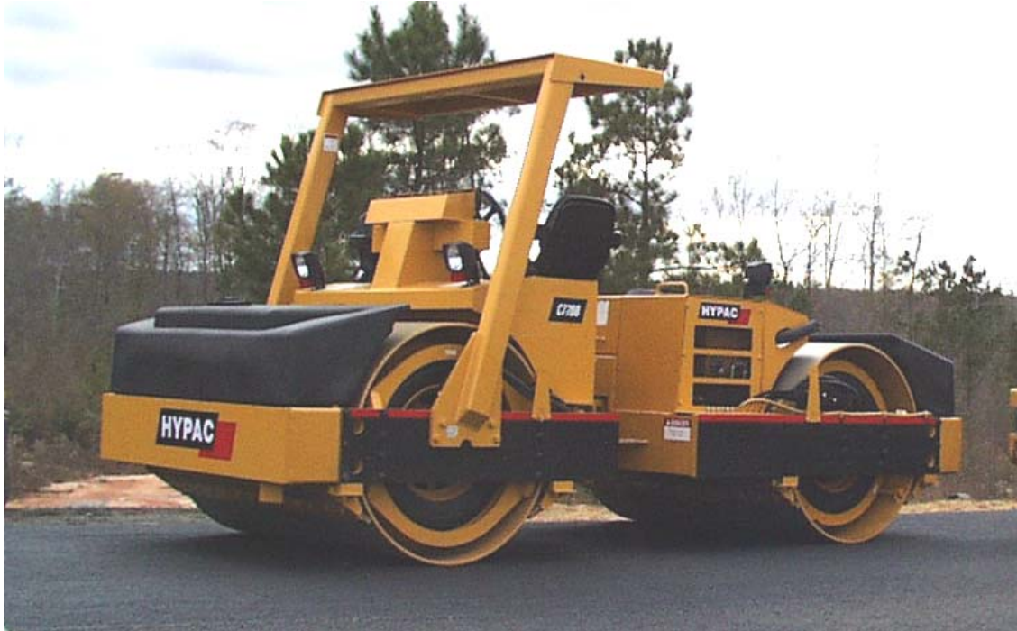
Figure 6. One of Two Vibratory Steel-Wheeled Rollers Utilized for Compaction

far end of the run, the first roller was then allowed to drive onto the uncompacted inside lane. When the roller reached the far end of the mat, it simply ramped down the overplaced mix and reversed direction. Relative increases in density were monitored in the inside lane to identify the breakpoint in the compaction operation, which was used to establish the roller pattern in the outside (research) lane. Vibratory steel-wheeled rollers (Figure 6) were used for breakdown rolling, a pneumatic rubber-tired roller (Figure 7) was used as necessary for intermediate rolling, and the vibratory steel-wheeled roller was used in static mode for finish rolling.