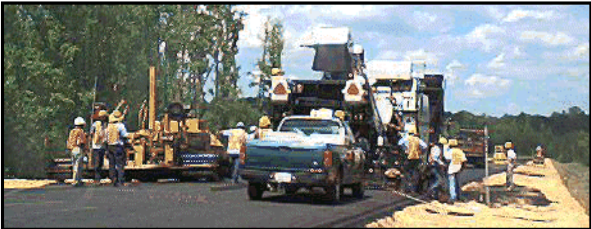
Figure 4. Typical Dual Lane Paving Operation Using MTD

A backhoe was then used to slice into the mound of material that had been left in place at the end of the run when the screed was lifted. This excess material was pulled back and pushed off the side of the shoulder for later cleanup and removal. With a cleanly defined fresh mat at the