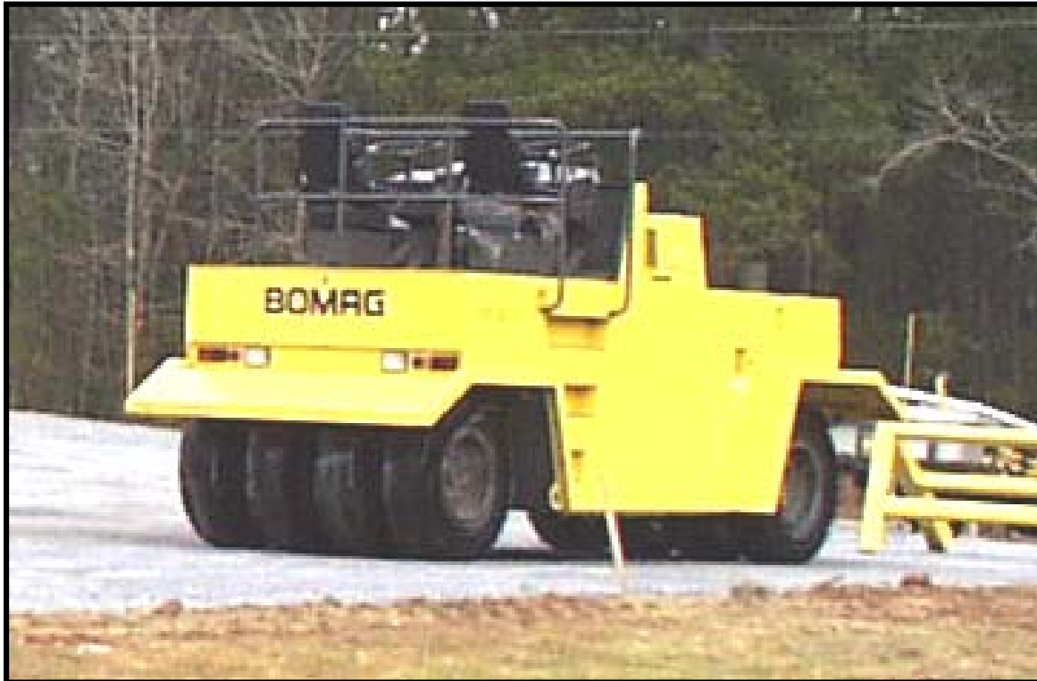
Figure 7. Pneumatic Rubber-Tired Roller Utilized for Compaction