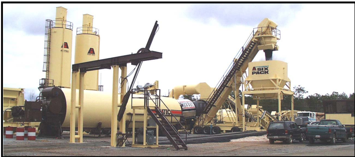
Figure 2. Onsite Double Drum Asphalt Plant Used to Produce All Track Mix

Laboratory job-mix formulas were used as a starting point when each mix was trial run through the plant for the first time, except that actual stockpile gradations were used to make subtle adjustments to the bin percentages wherever possible. Stockpile moisture contents were measured daily on any mixes that were scheduled for production to minimize the effect on plant operations and resulting final mix proportions. A portable double drum plant (presented as Figure 2) was temporarily located onsite to produce mix exclusively for Track construction with minimal haul times.