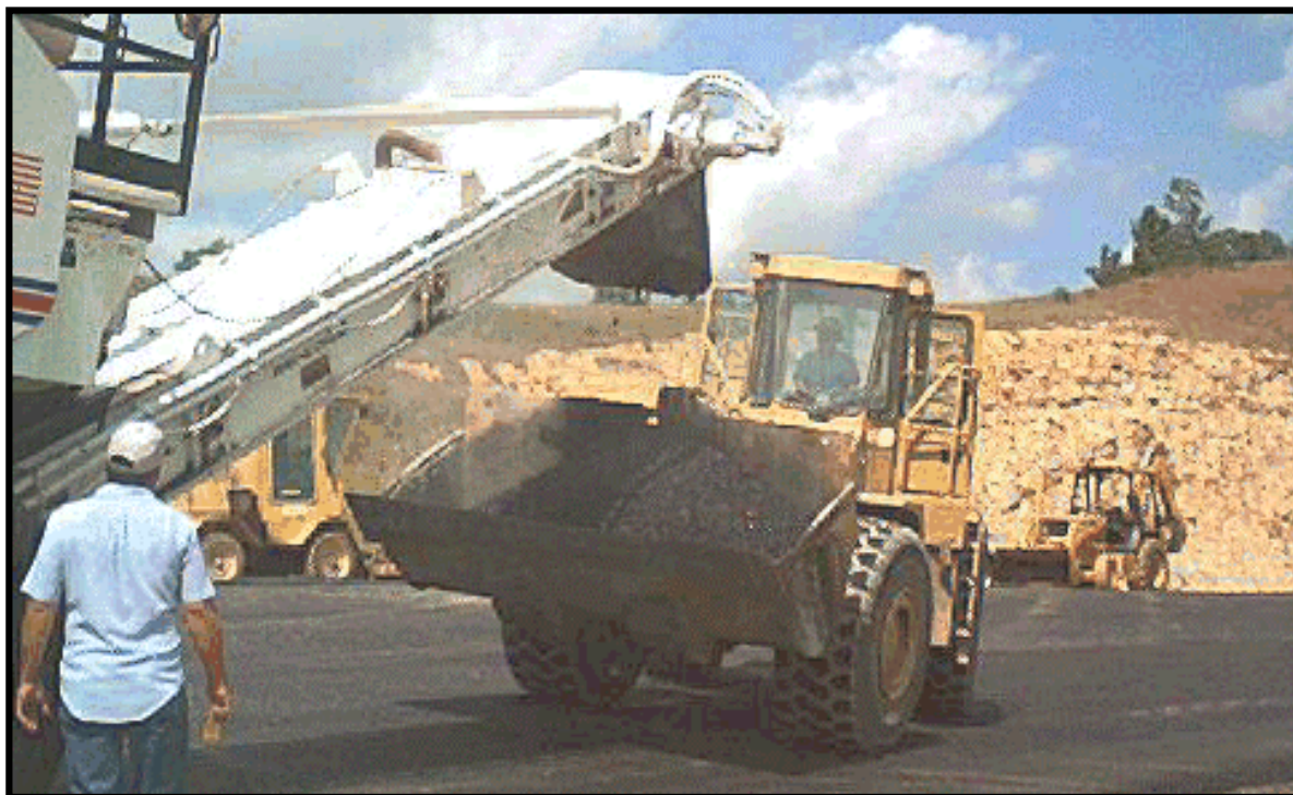
Figure 8. Obtaining Large Quantity of Representative Mix for Research