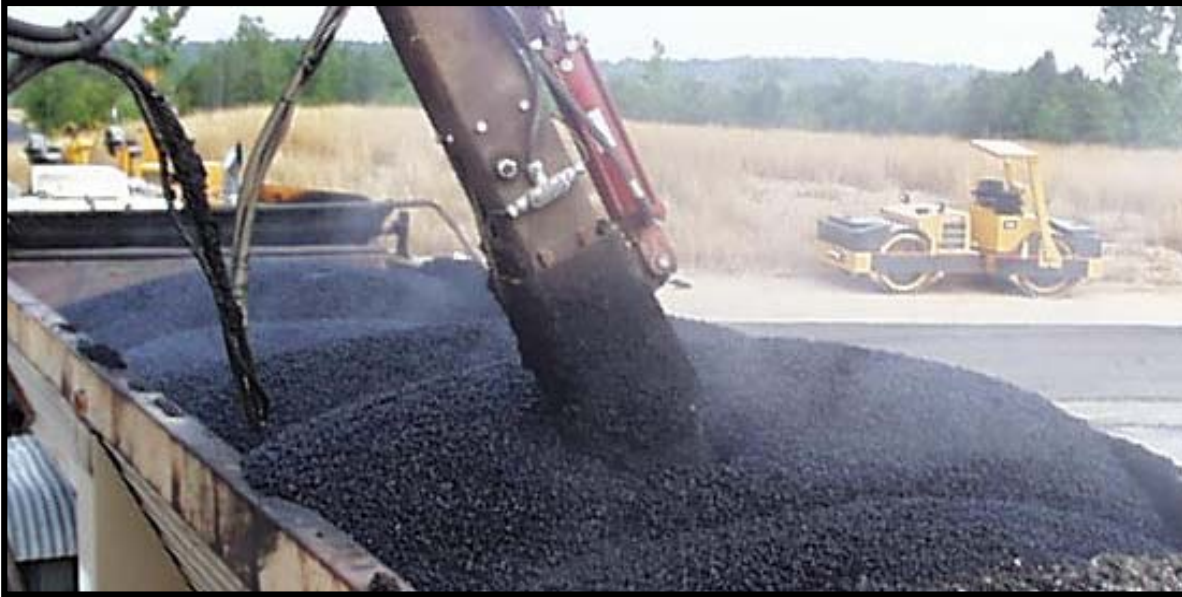
Figure 3. Sampling Representative Mix with Automated Robotic Sampler

sampler. A mechanical hot-mix sample splitting device was used in the onsite laboratory to avoid rapid cooling associated with conventional quartering and its subsequent effect on laboratory sample compaction temperatures.