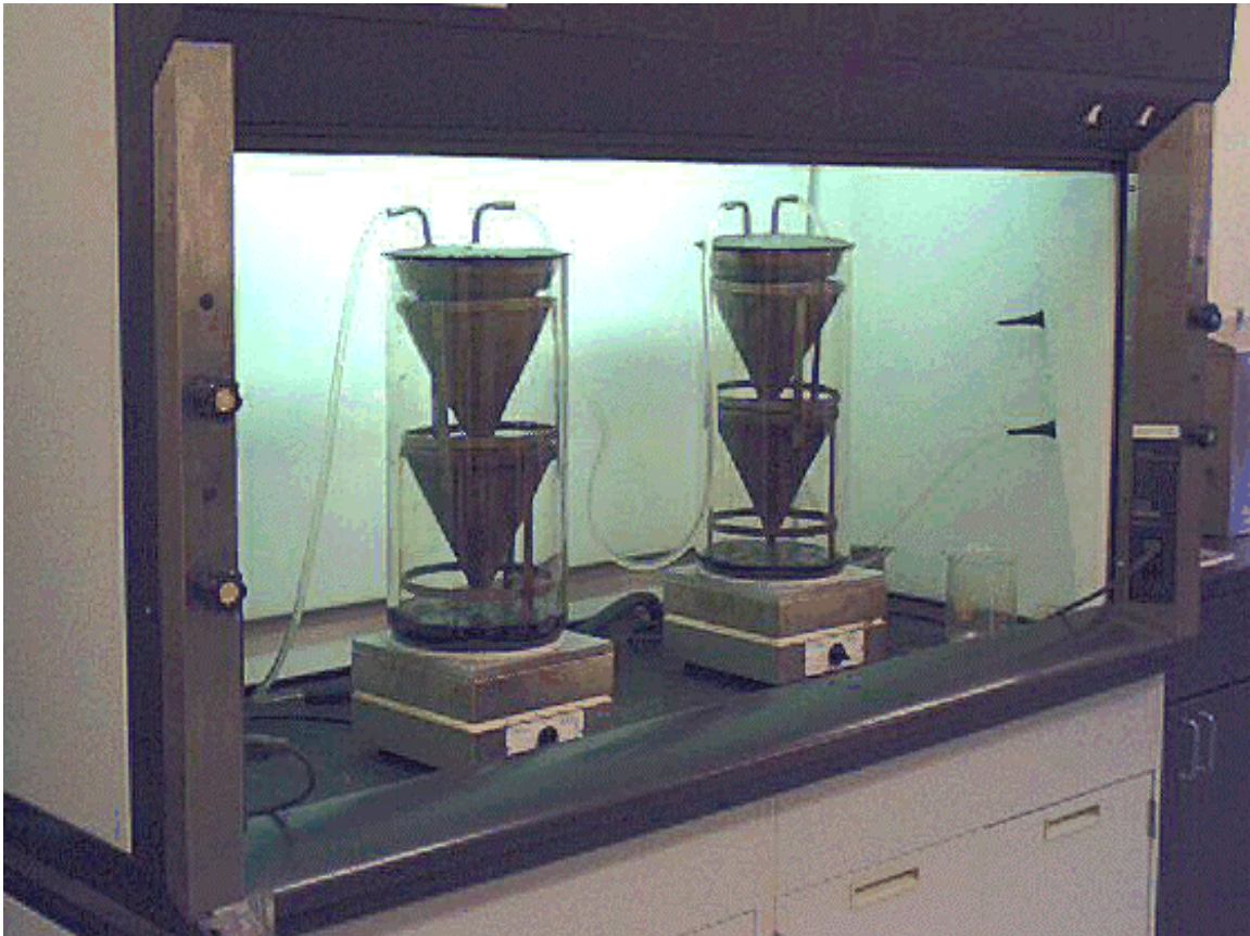
Figure 9. Reflux Extraction Verification Testing of Construction Samples