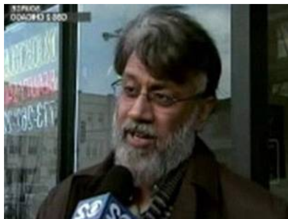
David Coleman Headley

Headley travelled with ease between the United States, Pakistan, and India and reportedly received specialized frogman training from members of the Pakistani Navy, which allegedly supports LeT. Headley also maintained contact with al-Qaeda operatives in North Waziristan. The revelation of these facts following his arrest in October, 2009 cast Headley as a capable and formidable operative. Experts suggest that others seeking to emulate the ‘James Bond super-spy’ lifestyle which Headley lived may prompt other potential foreign fighters to go abroad in search of adventure in the name of jihad.