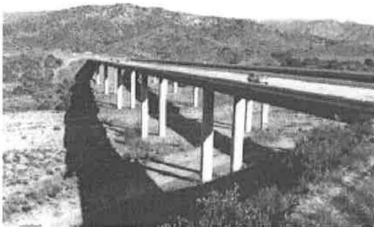
Figure 7. Viaduct on Highway 241 in southern California

Based on the survey in Table 2, none of the states reported using this concept for wildlife connectivity. Although there are numerous viaducts in the United States and Europe, wildlife movement was not the primary motive in their development. However, wildlife connectivity could be one of the multiple considerations resulting in a viaduct.