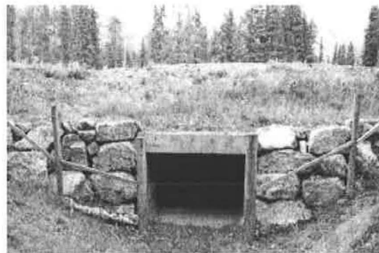
Figure 6. Box culvert used by wildlife in Banff National Park