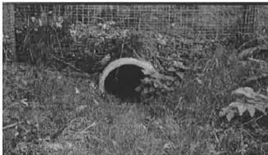
Figure 5. Fine mesh fence and culvert for small mammals in Europe.

Upland culvert systems were observed in most of the European countries and culverts are placed in known areas of amphibian movement to alleviate mortality on roadways. The Dutch, for example, are using concrete pipes, metal pipes, or rectangular concrete tunnels approximately 0.4 to 2.0 m in diameter in conjunction with fine mesh fencing for amphibians and reptiles, as well as other small animals.