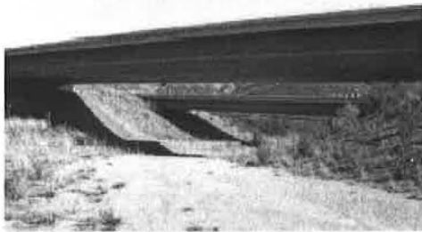
Figure 3. Snowslide gulch bridge for goats on Highway 2 near Glacier national Park, Montana (3m high x 3m wide x 11m long)

Twenty-three states reported using underpasses for wildlife (Table 2). Some species being addressed included bobcat and coyote in San Bernardino, California; Deer in most states and goats at Glacier national Park, Montana (Figure 3).