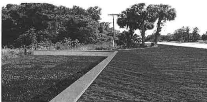
Figure 9. Short wall to keep reptiles and amphibians from road

Fencing for large and medium-sized mammals is required for underpass and overpass system to be effective. Standard fencing may not be effective for some species (black bear, coyotes), but manipulations of wildlife trails and vegetation can also be used to guide animals to passage ways and learning may enhance their effectiveness for these species over time. Fencing for large animals must also include one-way gates or earthen ramps to prevent animals that get onto roadways from being trapped between fences on both sides of road. Fencing for small mammals, reptile and amphibians must be specifically designed to prevent animals from climbing over and through, or tunneling under the fencing. Short retaining walls (Figure 9) can provide relative maintenance-free barriers for reptiles, amphibians and small mammals (USDOT and FHA, 2002). Table 2 shows that 28 of 34 responding states use all kinds of fences to protect different animals from highway disturbing.