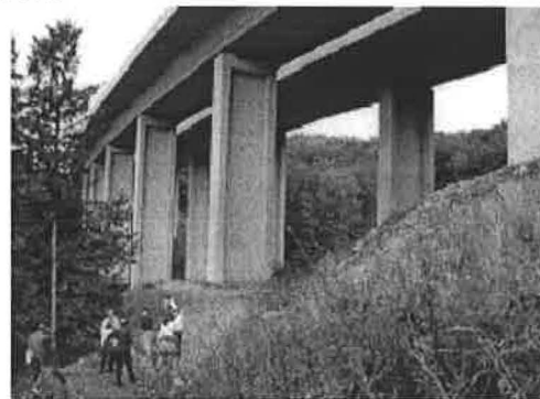
Figure 8. Viaduct on the Ljubljana-Trieste Highway in Slovenia