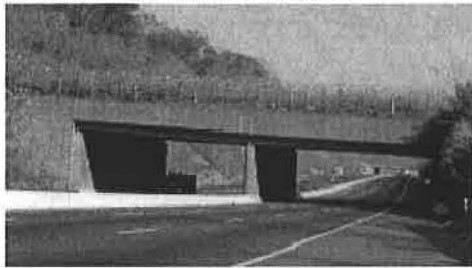
Figure 1. Overpass being used by deer and Other wildlife in New Jersey (91.46m wide)

behavior on the overpasses was more normal on the wider structures. Soil on these overpasses ranging in depth from 0.5 – 2 m, allows for the growth of herbaceous vegetation, shrubs and small trees. As guidance for soil depth for plants on overpasses, the Germans use 1/3 m for grass, 2/3 m for shrubs, and 1.5 to 2 m for trees (USDOT and FHA, 2002). Some overpasses contain small ponds fed by rainwater. Sometimes board fence are used along the edge of an overpass to prevent traffic noise and lights from disturbing wildlife.