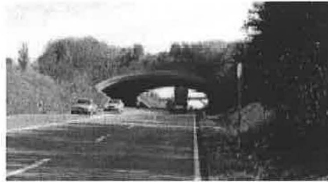
Figure 2. Vegetated overpass in German approximately 50 m wide.

Primary advantages of overpasses relative to underpasses are that they are less confining, quieter, maintain ambient conditions of rainfall, temperature and light, and can serve both as passage ways for wildlife and intermediate habitat for small animals such as reptiles, amphibians and small mammals. They are probably less effective for semi-aquatic species, such as muskrats ( Ondatra zibethica ), beavers ( Caster canadensis ) and alligators ( Alligator mississippiensis ). By providing intermediate habitat, overpasses may provide the only feasible means for allowing various species of animals to cross highways. The major drawback is that they are rather expensive.