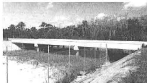
Figure 4. One of 23 wildlife underpasses on I-75 (Alligator Alley) in Southern Florida California (36.5m high x 2.44m high)

Florida used 2.44m high and 7.32m wide box culverts for a variety of species in central and south Florida (TRB, 2002). Depending on the remoteness of the area of use, these concrete boxes can be either cast in place or pre-cast for shipment to the site. Fencing associated with these crossing was 3.04 m in height with three strands of barbed wire on an outrigger. A wide variety of species use the culverts, including the Florida panther and black bear (Land and Lotz 1996; Roof and wooding 1996).