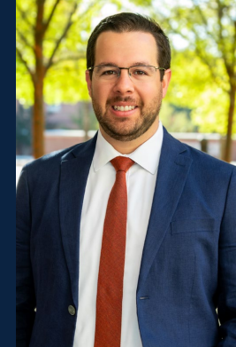
Michael A. Perez Construction Management