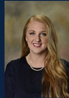
Director of Professional Development 334-844-2130 scy0001@auburn.edu