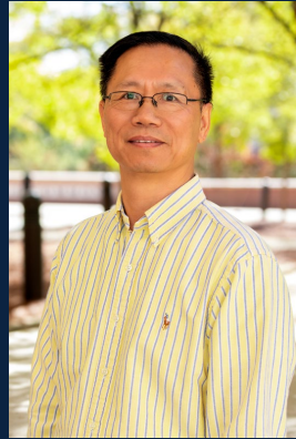
Xing Fang Water Resources