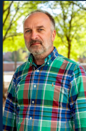
Rod Turochy Transportation