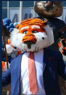
TBA (A-I) 334-844-2129 mrg0014@auburn.edu