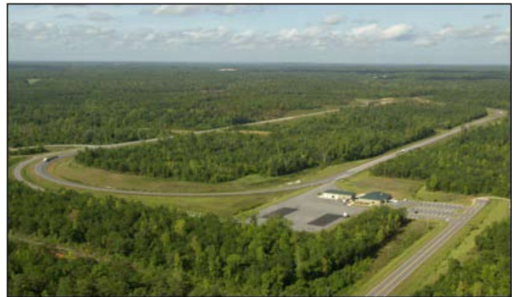
Figure 2. Aerial photo of the NCAT Test Track

Eight structural test sections were constructed on the 1.7-mile NCAT Test Track – one of the most advanced and comprehensive facilities of its kind in the world. These test sections were subjected to a two-year, 10 million ESALS loading cycle which began in 2003.