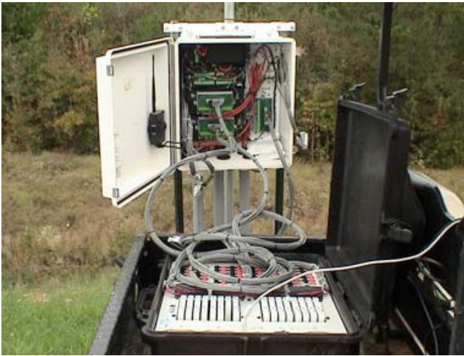
Figure 3. Dynamic data acquisition scheme

All inputs shown in Figure 1, including material properties, environment, traffic and the pavement structure, for M-E analysis were measured and quantified, in situ, at the test track. The pavement response was measured from field instrumentation such as strain gauges and pressure plates (Figure 3.) rather than calculated using a theoretical model. And finally, the pavement performance, including fatigue cracking (Figure 4.), was monitored and recorded in the field.