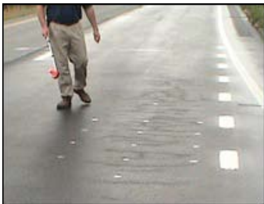
Figure 4. Progressed fatigue cracking