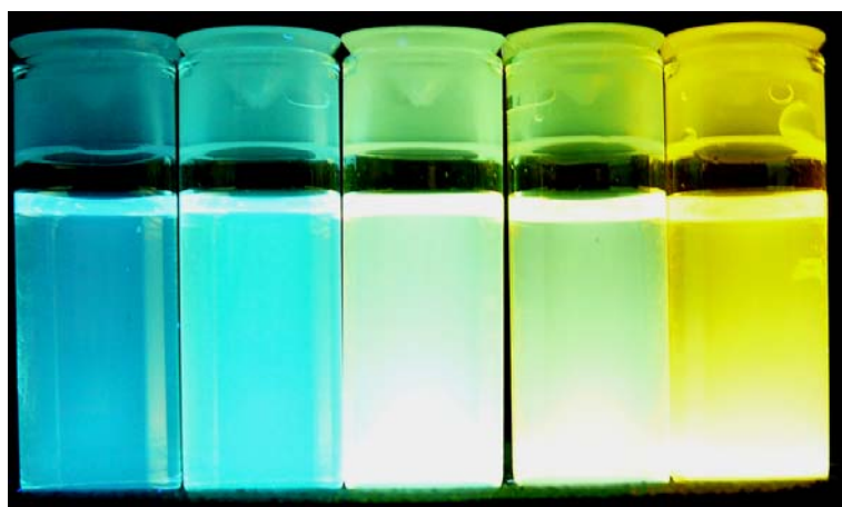
Conducting polymer fluorescence