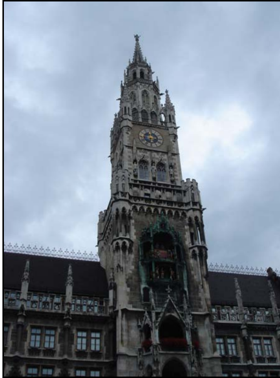
The famous Glockenspiel in Munich,Germany