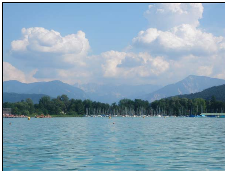
The beautiful Woerthersee in Klagenfurt, Austria