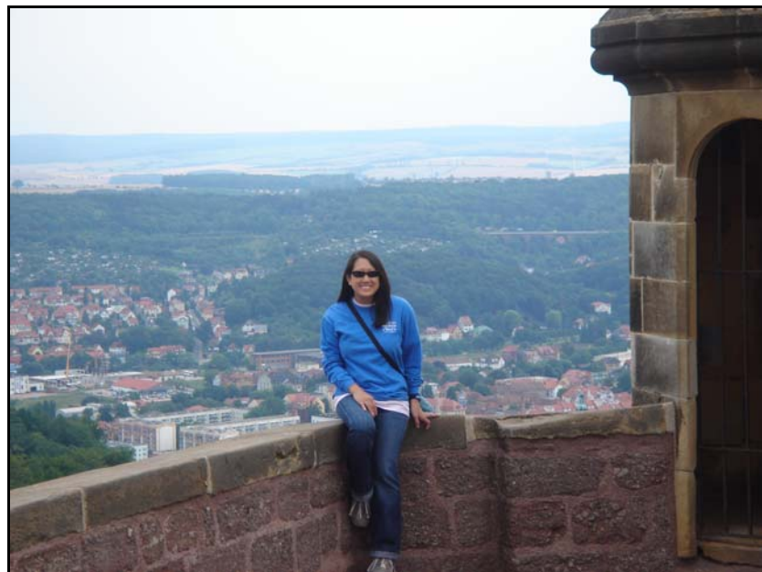
Over looking the city of Eisenach