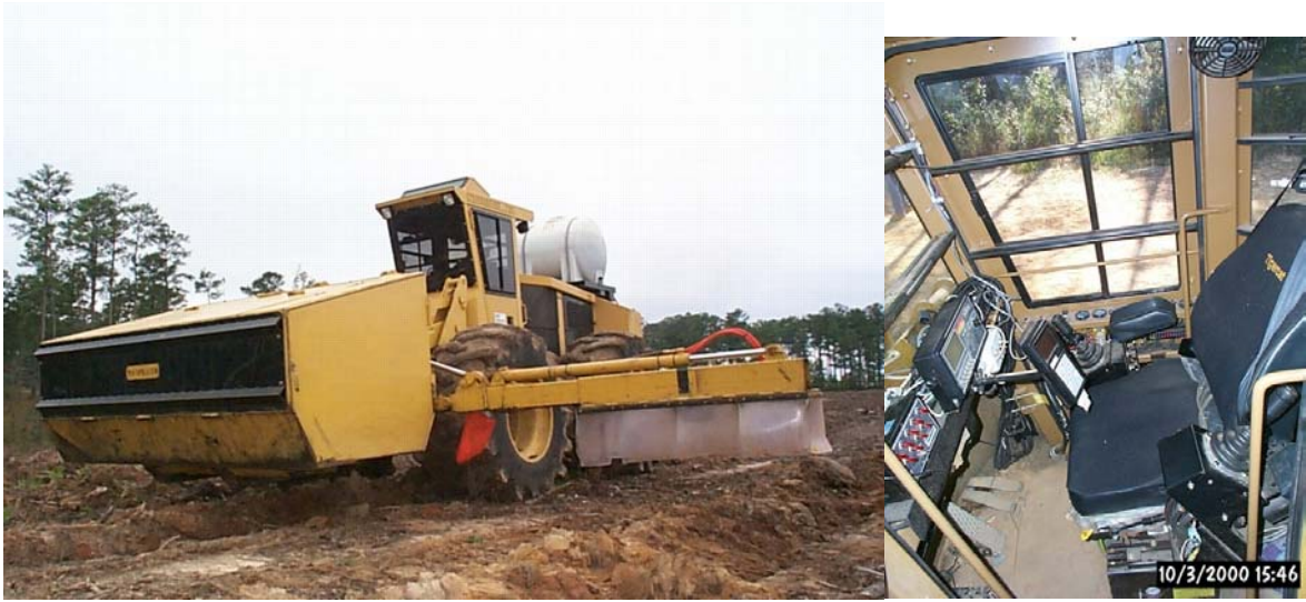
Figure 1. Photograph of WS sprayer configured for banded spraying. Inset shows the cab with field computer and other spray controller equipment.