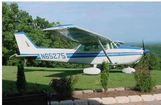
Figure 1. A typical private aircraft

There are vendors who sell canvas covers that lay over the windows and are attached to the outside of smaller aircraft in an attempt to restrict the sun from entering the cockpit. This application appears to be marginally effective at best. There are also vendors who sell custom fit reflective materials that are installed in the inside window openings of an aircraft. This reflective material must be cut to the exact size of the window, and then, from the inside, one must press the specific sized reflective material for that particular window opening into the area around the window on the inside of the aircraft. This method is used with smaller aircraft. Since the reflective material is on the inside of the Plexiglas window, a great deal of heat builds up between the actual reflective material and the inside of the window or Plexiglas, causing great stress to the window or Plexiglas and reducing its life.